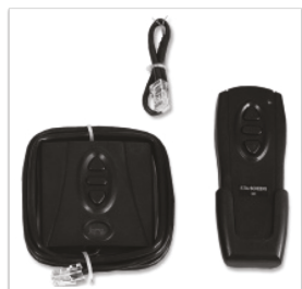
IR remote, 12v trigger, keypad switch