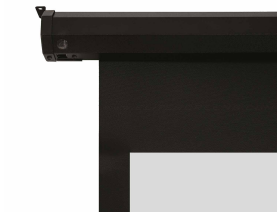
Durable metal black housing for wall/ceiling installation